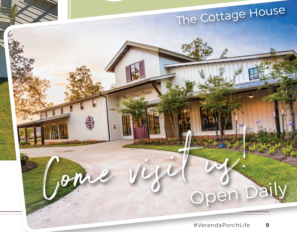
The Cottage House

With a beach-style entry, an island slide and splash pad, this is every kids' ideal summer oasis.