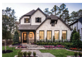
HIGHLAND HOMES from the $370's