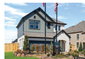
DAVID WEEKLEY HOMES from the $300's