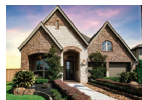
PERRY HOMES from the $360's