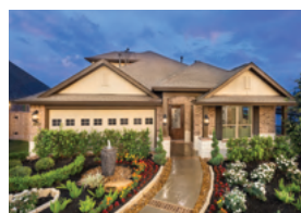
LENNAR HOMES from the $350's