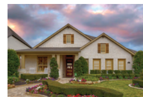
HIGHLAND HOMES from the $440's