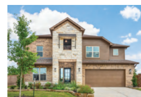
SITTERLE PATIO HOMES from the $370's