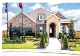
DAVID WEEKLEY HOMES from the $320's