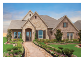
COVENTRY HOMES from the $500's