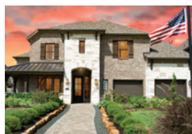
WESTIN HOMES from the $440's