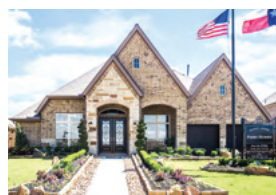
PERRY HOMES from the $470's