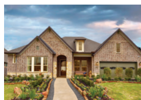
DAVID WEEKLEY HOMES from the $390's