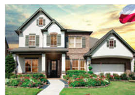
NEWMARK HOMES from the $400's